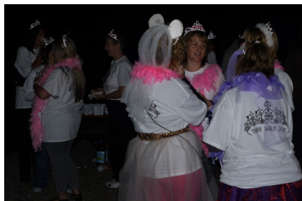
Some of the 'Ladies of the Nite' out in the town!

A big thank you to everyone who helped organise the event, the walkers and the sponsors!