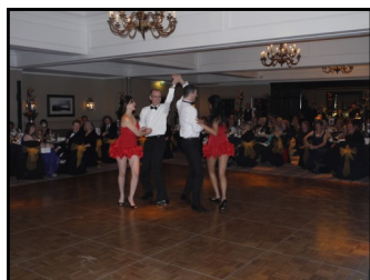
Salsa Dancing Demonstration

Our James Bond themed Ball was a fantastic event. The room looked beautiful, the meal was delicious and the entertainment was wonderful! We raised around £5,000 on the night so thank you to everyone involved!